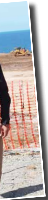
left. and officially open