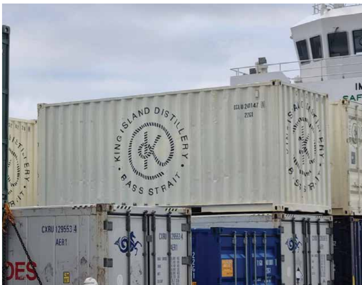
King Island Distillery Bass Strait containers are unloaded from the John Duigan.